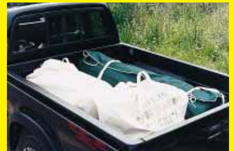
Fits in a small pickup truck.